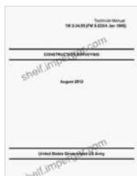
Image alt attribute: Technical Manual TM 34-55 FM 233, a comprehensive guide to construction surveying techniques and principles.