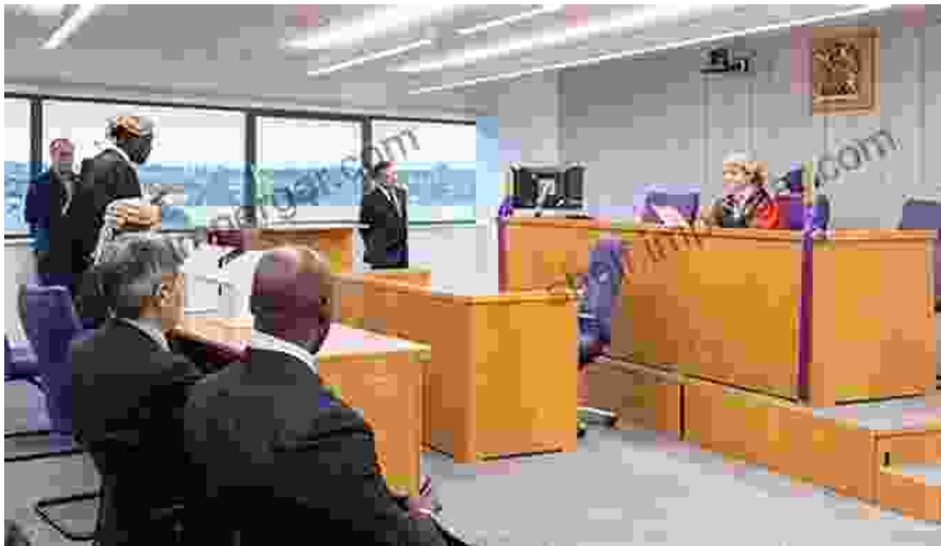
Image Alt Attributes