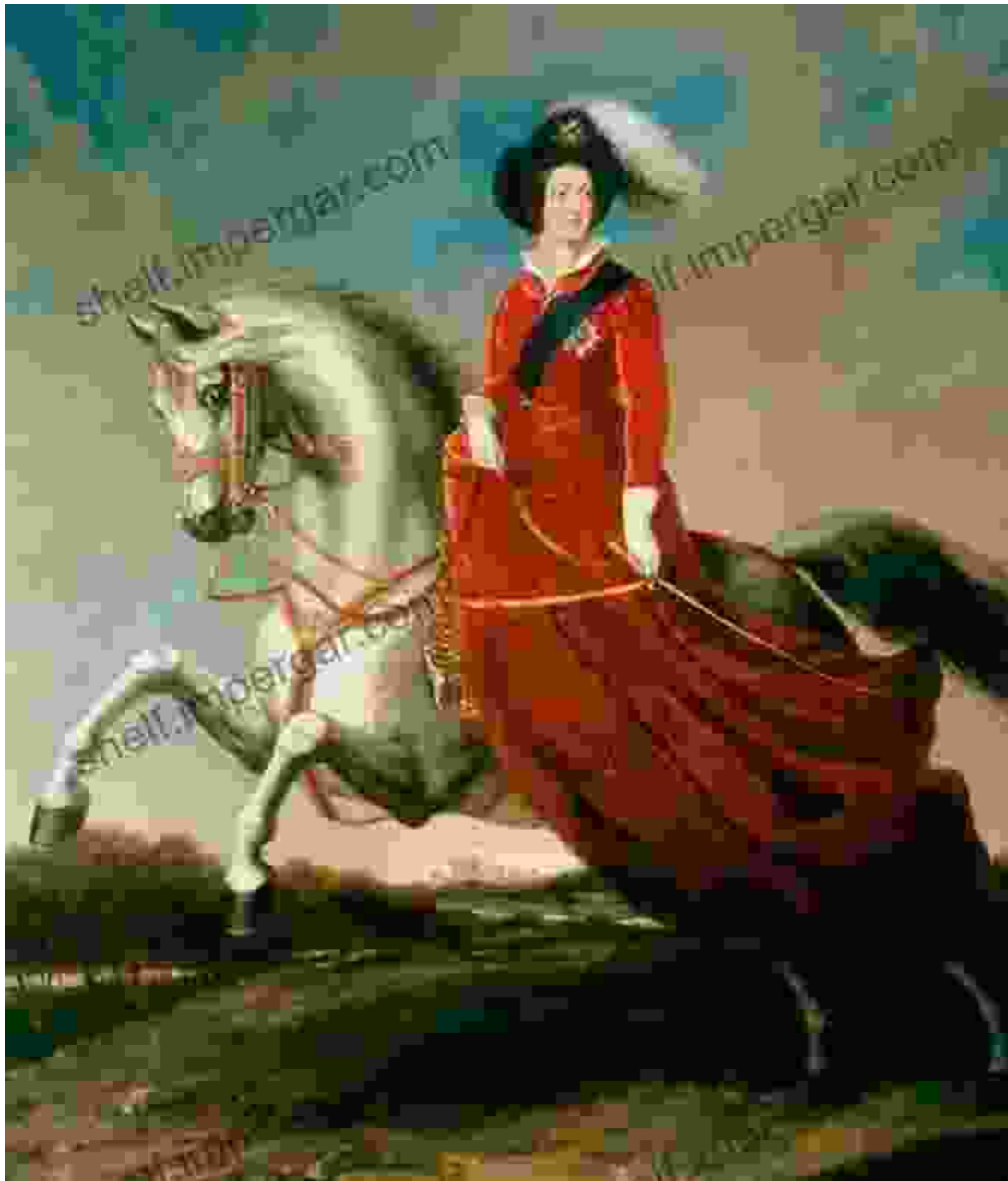
King Edward VII: The Sportsman King

Under Victoria's patronage, the sport flourished. She established the Royal Ascot racecourse, which remains one of the most prestigious racing events in the world. She also introduced the tradition of the Derby Stakes, a 1.5-mile race for three-year-old horses, which has since become one of the most iconic spectacles in the British sporting calendar.